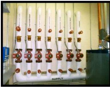
COMMERCIAL BUILDING. BETHEL, AK 2002