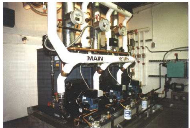
COMMERCIAL BUILDING – FAIRBANKS, ALASKA 1994

Using the same calculation for 20 feet total of non-insulated 3" Copper boiler headers (Supply & Return) would result in 18 gallons of heating fuel used in a 30 day period versus if the headers were insulated with a heating fuel consumption of only 4 gallons in the same 30 day period.