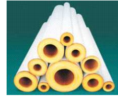
FIBER GLASS PIPE INSULATION

"Bare heating piping mains covered with fiberglass pipe insulation SAVES on heating fuel oil consumption"