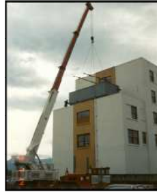
SETTING THE NEW AIRHANDLER (AHU)