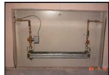
NEW HYDRONIC CABINET HEATERS

HIGHLIGHTS OF ALASKA NATIVE HOSPITAL - ANCHORAGE, ALASKA BID - MECHANICAL SUB CONTRACT