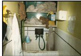
MOP SINK BEFORE DEMOLITION