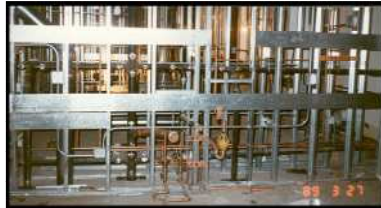
NEW WASTE - VENT & WATER PIPING FOR ONE OF MANY SINKS