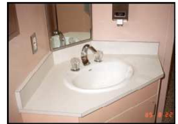
FINISHED PRODUCT LADIES BATHROOM