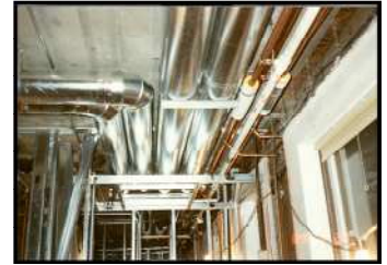
AIR DUCTS AND HEAT PIPING TO AHU