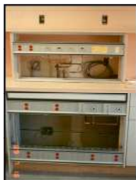
ROUGHING IN GAS PANELS