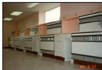
FINISHED NEW MEDICAL GAS PANELS