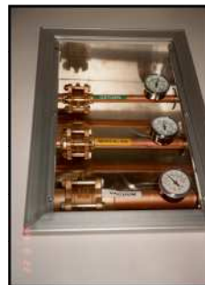
NEW MEDICAL GAS PIPING