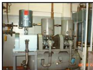
AFTER - NEW VACUUM SYSTEM